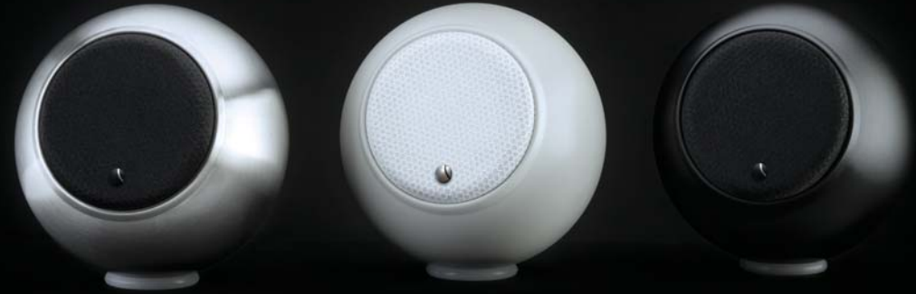
A'DIVA SE STAINLESS STEEL, MATT WHITE AND SATIN BLACK