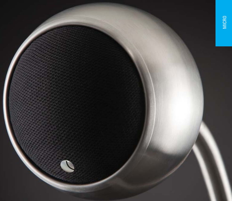
MICRO STAINLESS STEEL ON FLOORSTAND