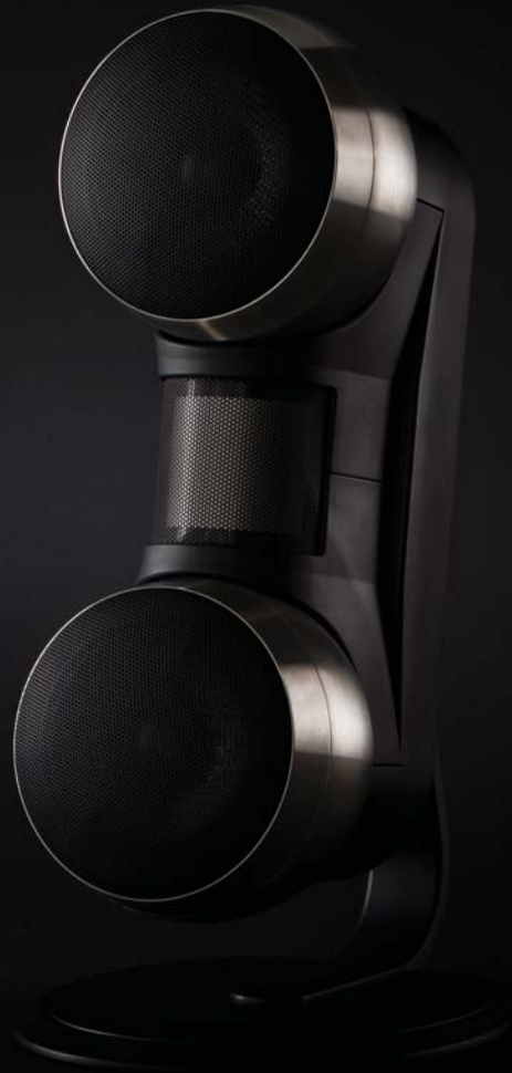
STRADA 2, BLACK AND STAINLESS STEEL