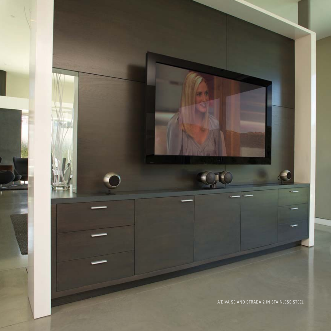
A'DIVA SE AND STRADA 2 IN STAINLESS STEEL