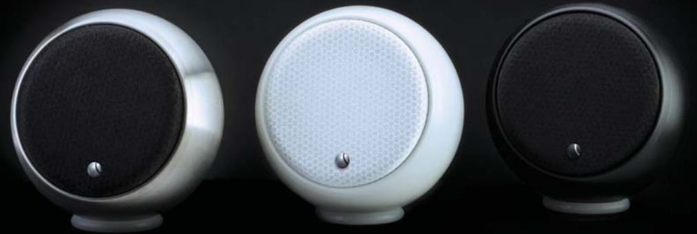
MICRO SE STAINLESS STEEL, MATT WHITE AND SATIN BLACK