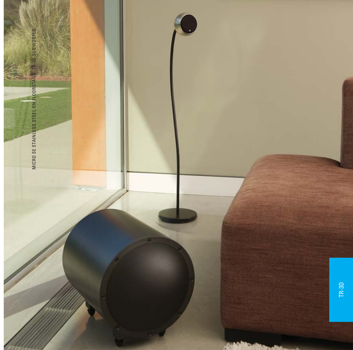
MICRO SE STAINLESS STEEL ON FLOORSTAND. TR-3D SUBWOOFER.